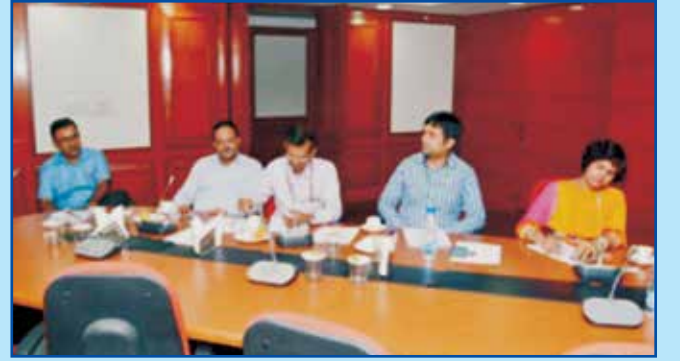
प्रतियोगिता निर्णायक मंडल