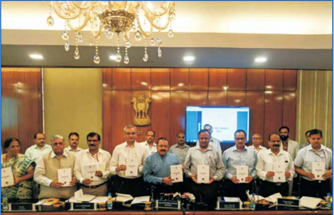
Release of VIGILANCE MANUAL-2017 by Dr. Jitendra Singh, Hon'ble MoS (PP) on 07.09.2017

Note- VIGILANCE MANUAL-2017 is available on the Commission's website www.cvc.nic.in .