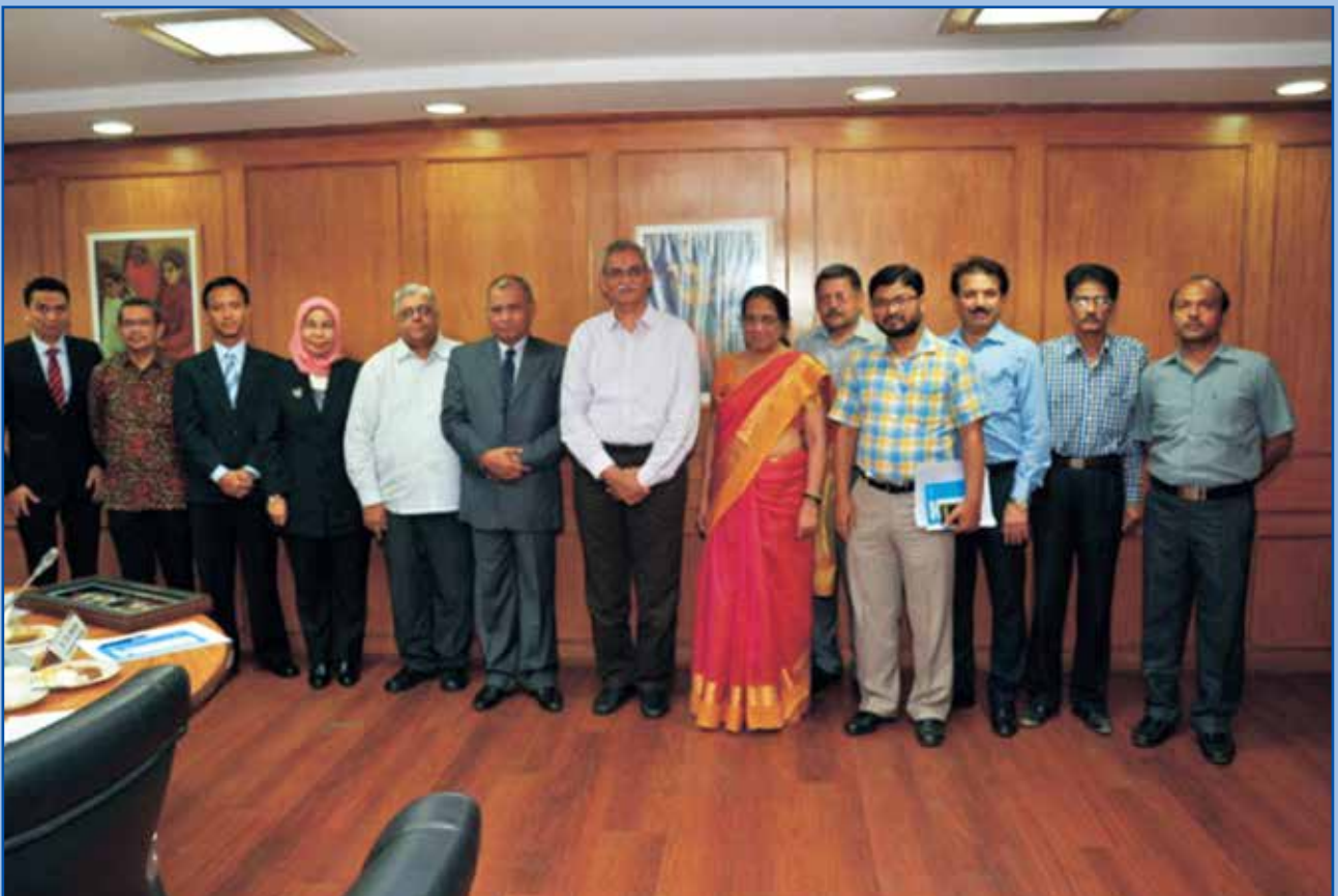
Delegates from Indonesia visited the Commission on 14.09.2017

Note- VIGILANCE MANUAL-2017 is available on the Commission's website www.cvc.nic.in .