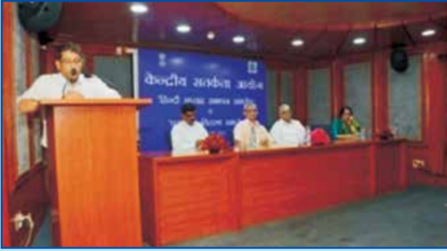
हिंदी सप्ताह समापन समारोह

केन्द्रीय सतर्कता आयोग में हिंदी सप्ताह ( १४ सितम्बर से २० सितम्बर, २०१७ ) मनाया गया। इस अवसर पर हिन्दी निबंध, वाद-विवाद एवं स्वरचित काव्य-पाठ प्रतियोगिताओं का आयोजन किया गया।