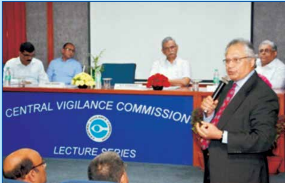
Shri Shiv Khera delivering the lecture on 31.07.2017