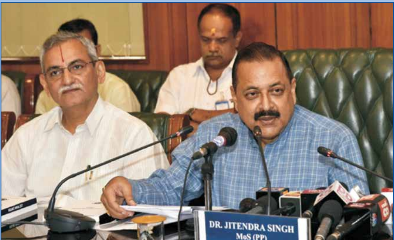
Dr. Jitendra Singh, Hon'ble MoS (PP) addressing the gathering on 07.09.2017